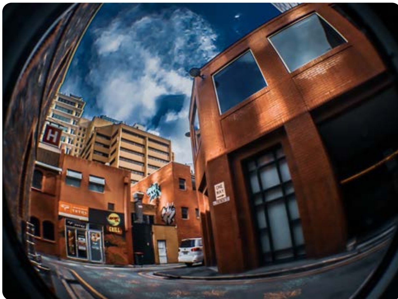
SENIOR SCHOOL PHOTOGRAPHY