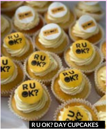
R U OK? DAY CUPCAKES