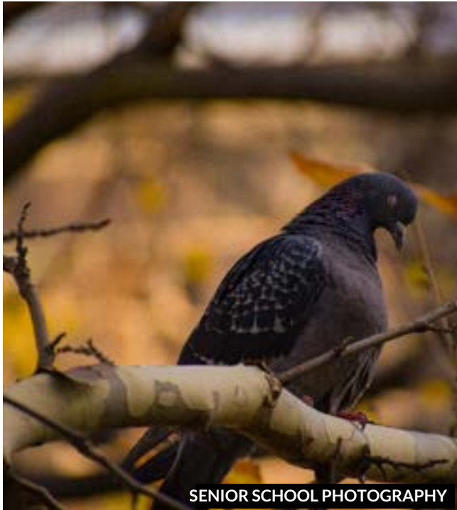
SENIOR SCHOOL PHOTOGRAPHY