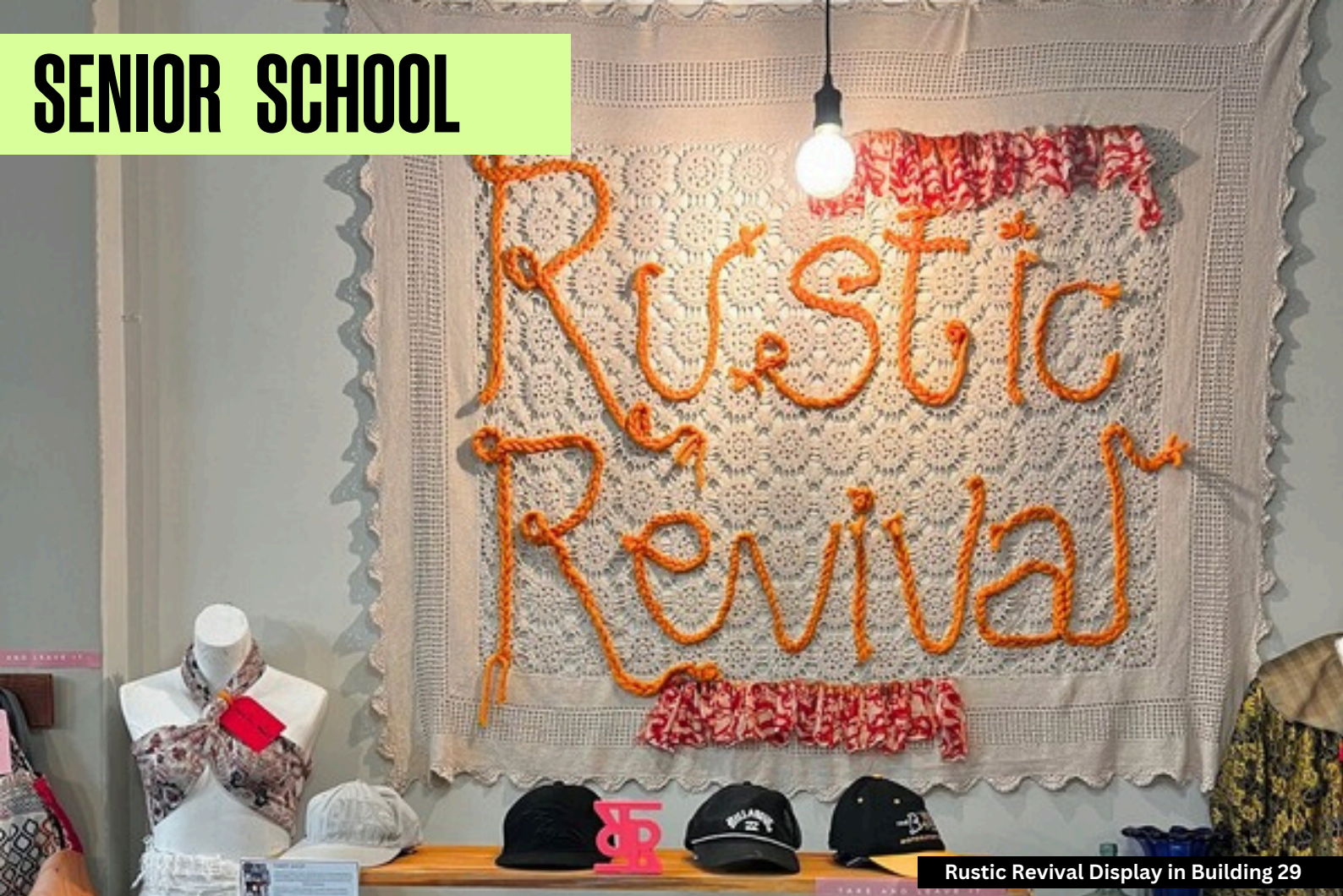
Rustic Revival Display in Building 29