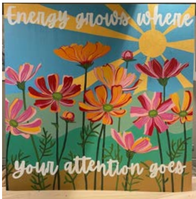
SASY'S WINNING MURAL