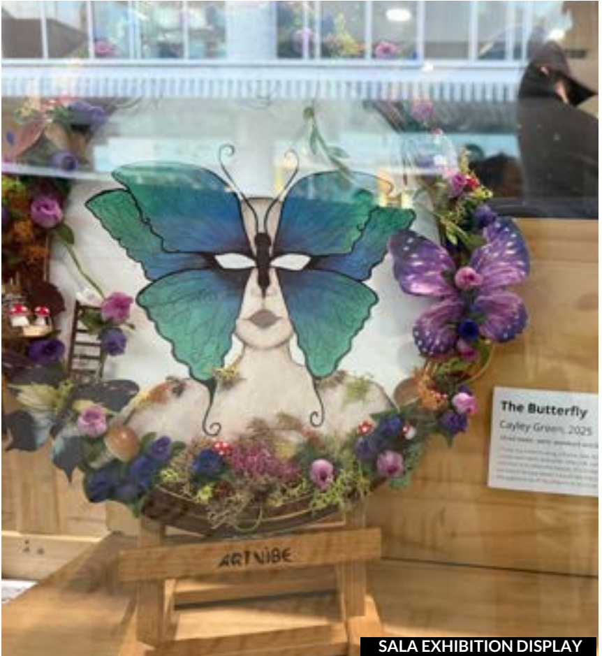
SALA EXHIBITION DISPLAY