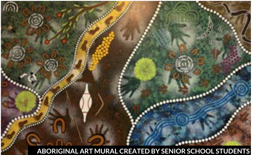
ABORIGINAL ART MURAL CREATED BY SENIOR SCHOOL STUDENTS