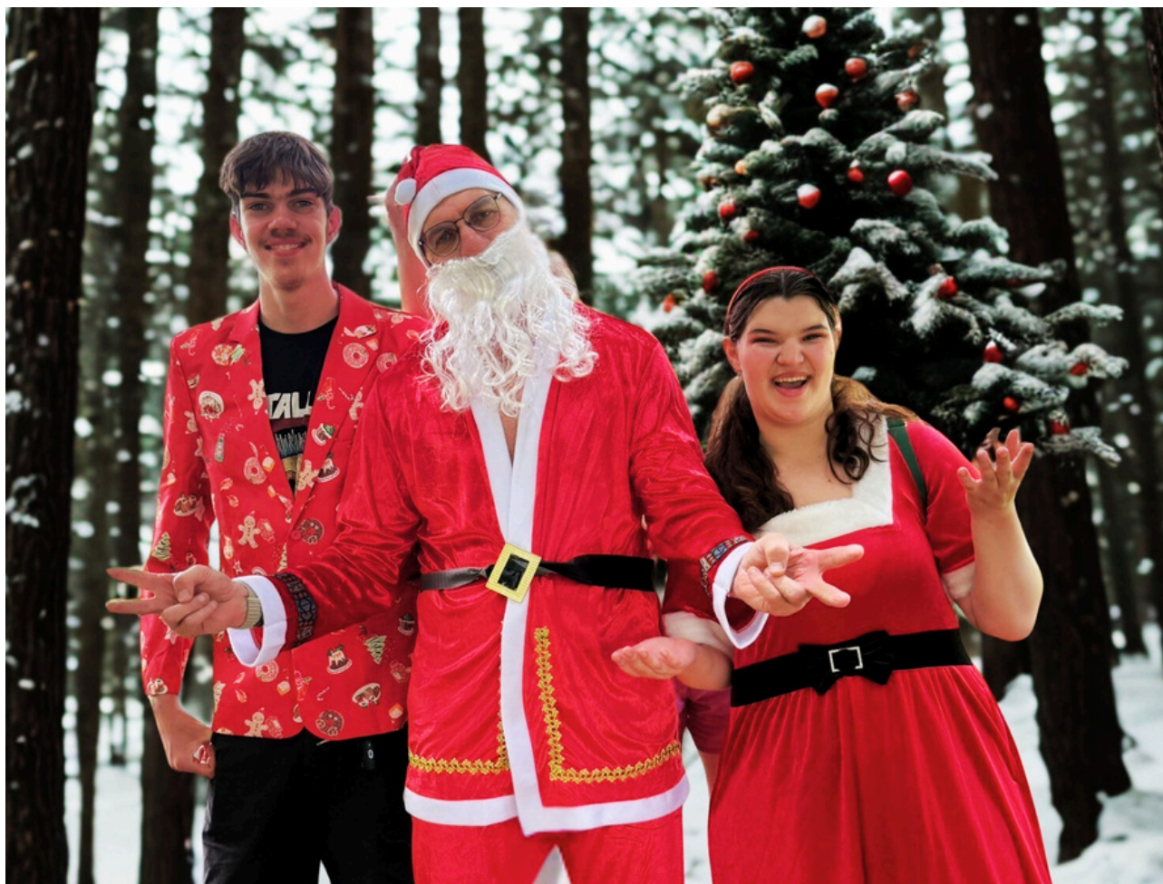
END OF YEAR STUDENT CHRISTMAS LUNCH- SANTA AND HIS HELPERS