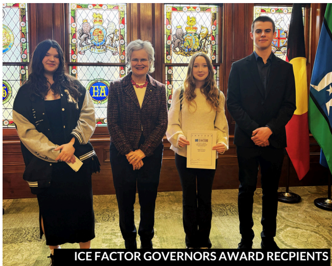
ICE FACTOR GOVERNORS AWARD RECIPIENTS