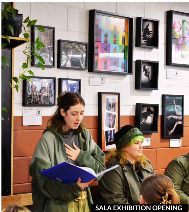
SALA EXHIBITION OPENING