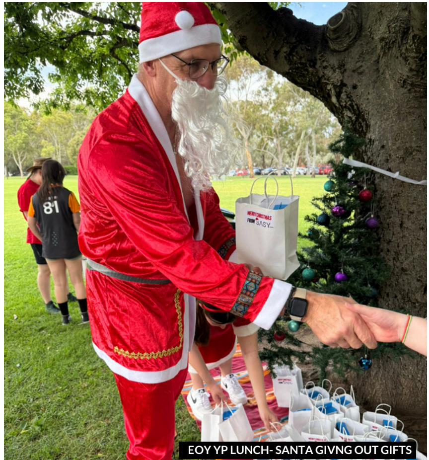
EOY YP LUNCH- SANTA GIVING OUT GIFTS