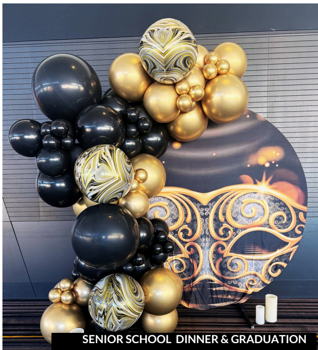
SENIOR SCHOOL DINNER & GRADUATION