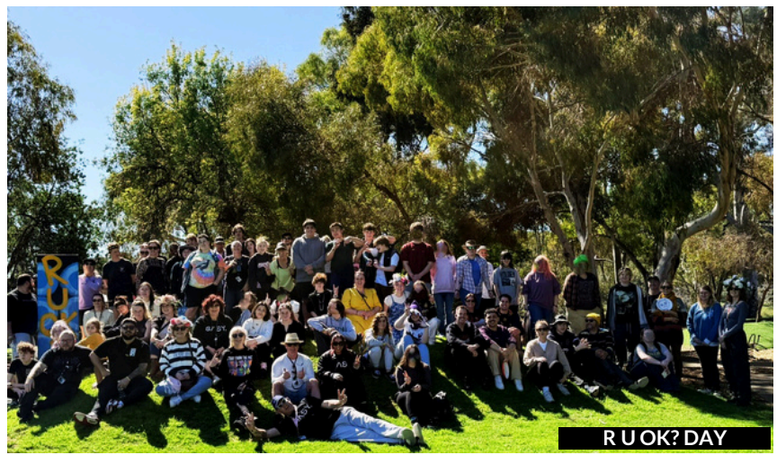
R U OK? DAY