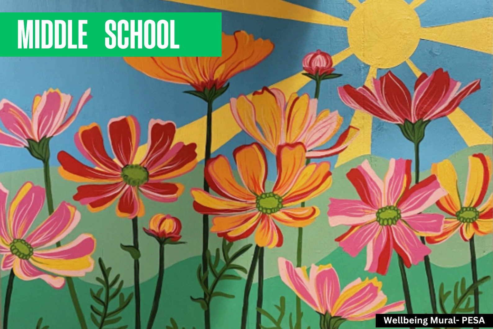
Wellbeing Mural- PESA