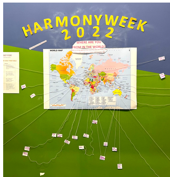
STUDENTS & STAFF MAPPING WHERE THEY'RE FROM IN THE WORLD DURING HARMONY WEEK, TERM 1

With change comes challenges, but this Term has been incredibly positive and our young people have been adjusting amazingly to the new SASY Way!