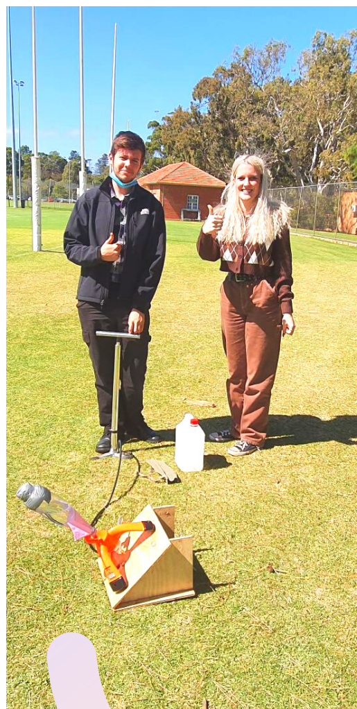
L: MEDIA CLUB AT THE CINEMAS R: ROCKET THAT NEIGHBOURHOOD

Students in the 'Rocket That Neighbourhood' program, have been involved in preparing their water