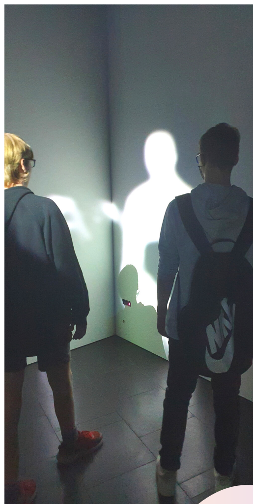
L: ABSEILING AT MORIALTA R: MOD. MUSEUM OF DISCOVERY

We are proud of how the young people have adapted and grown this Term!