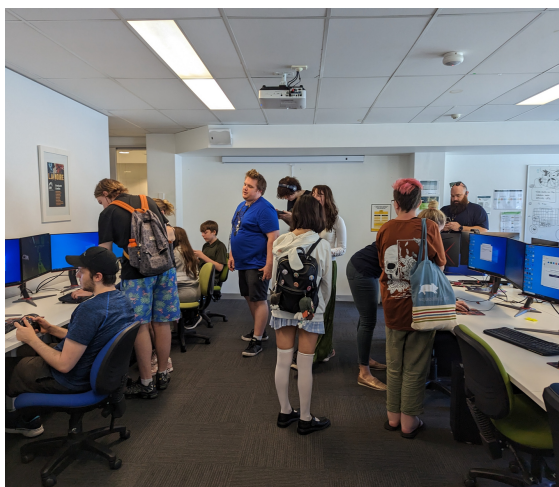
EXCURSION TO ACADEMY OF INTERACTIVE ENTERTAINMENT (AIE)

We can't wait for what next Term brings!