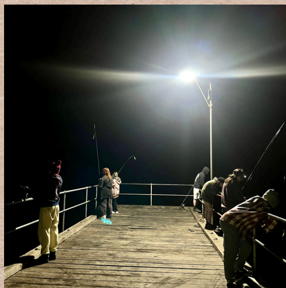
SENIOR ADVENTURE CAMP PHOTOS