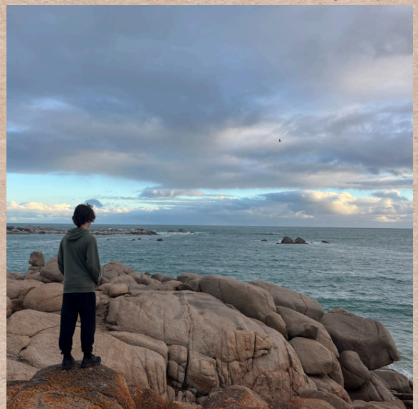
SENIOR ADVENTURE CAMP PHOTOS