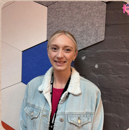
TeeJay Youth Worker