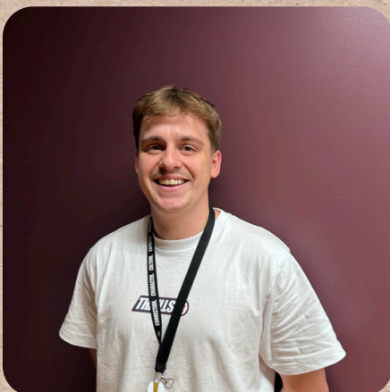
Tom Youth Worker