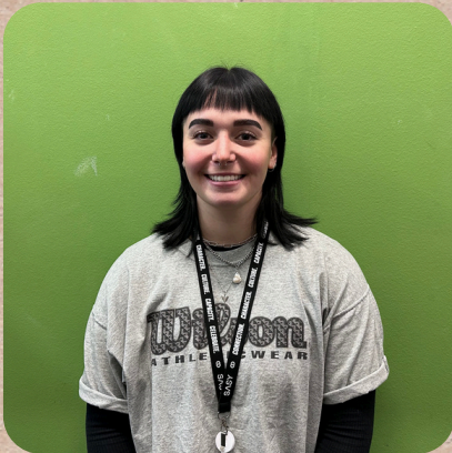
Louise Youth Worker