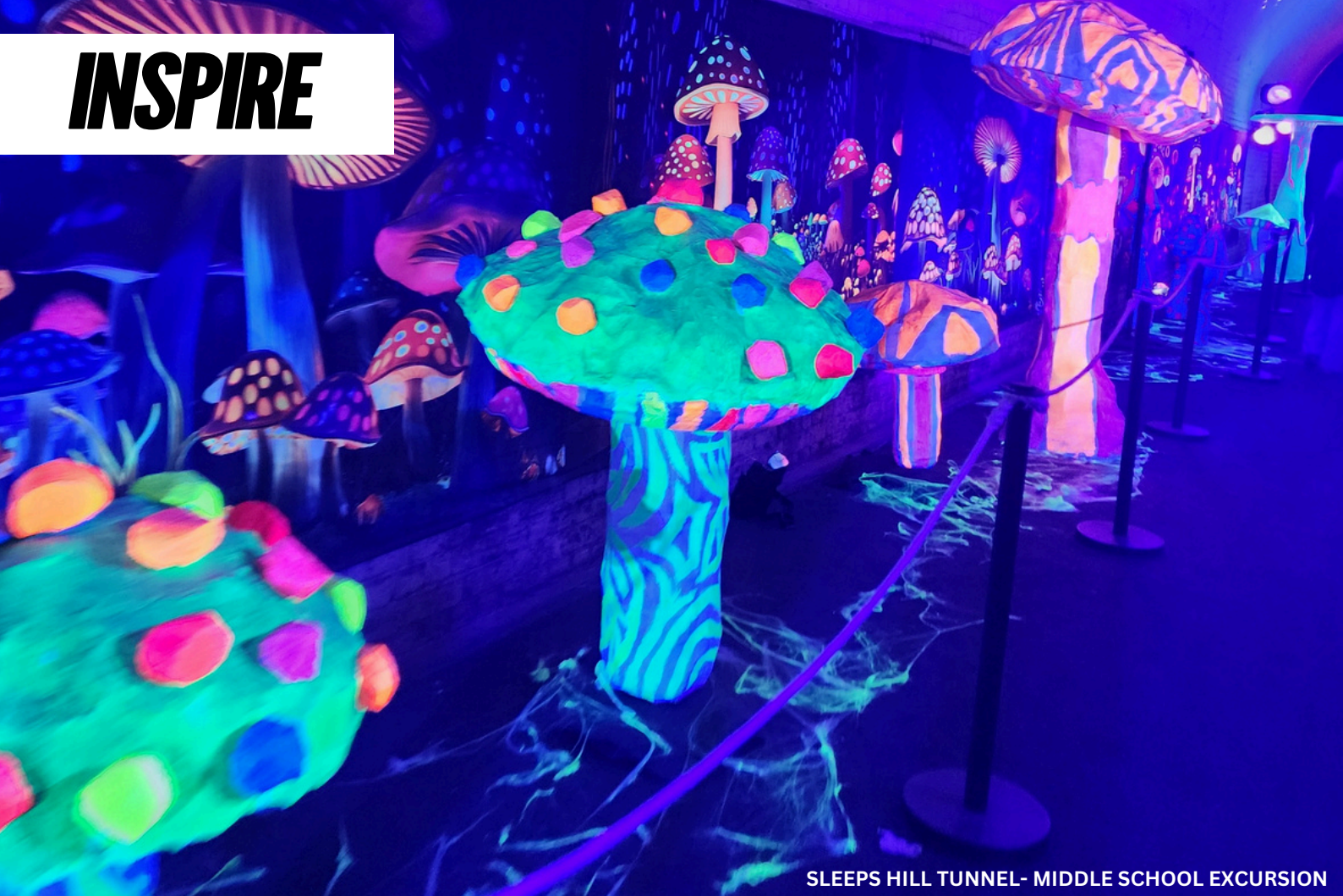
SLEEPS HILL TUNNEL- MIDDLE SCHOOL EXCURSION