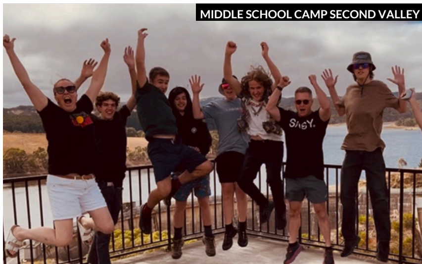
MIDDLE SCHOOL CAMP SECOND VALLEY