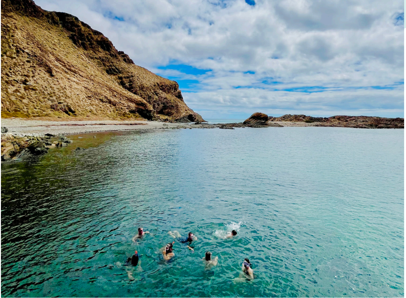
MIDDLE SCHOOL FISHING CAMP AT SECOND VALLEY