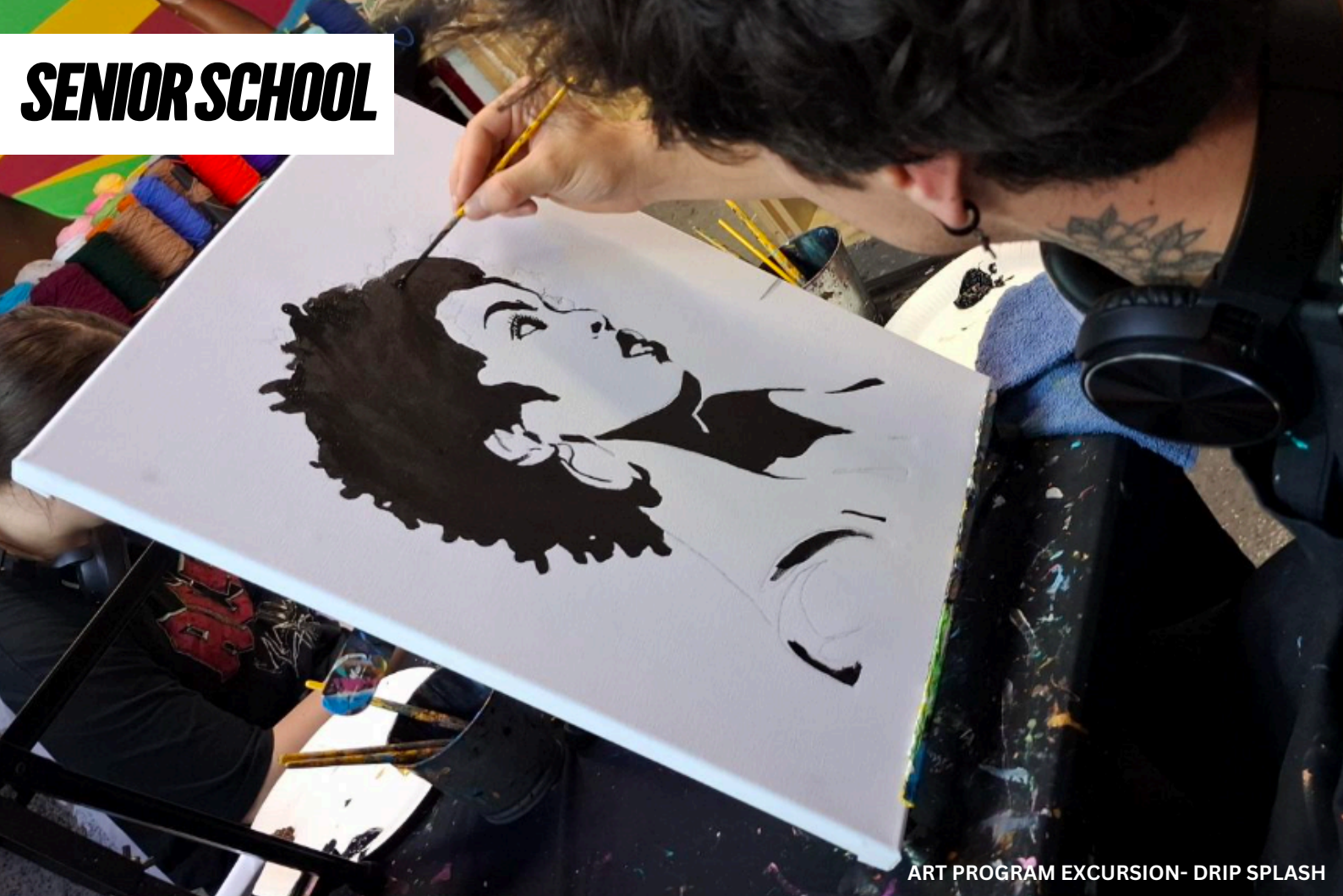
ART PROGRAM EXCURSION- DRIP SPLASH