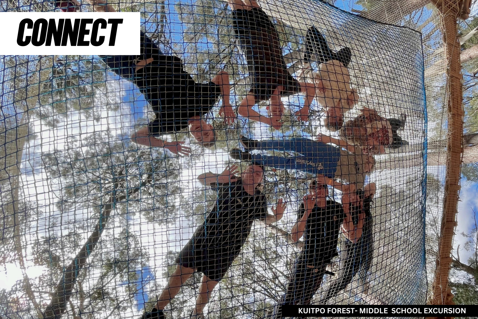
KUITPO FOREST- MIDDLE SCHOOL EXCURSION