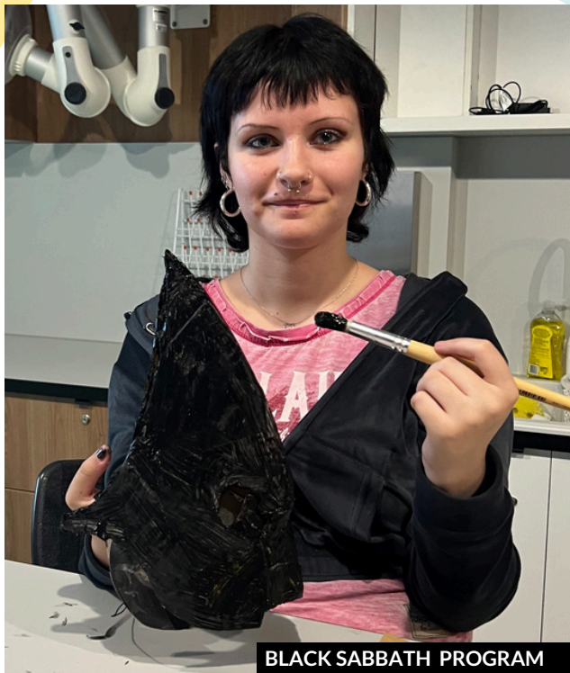
BLACK SABBATH PROGRAM