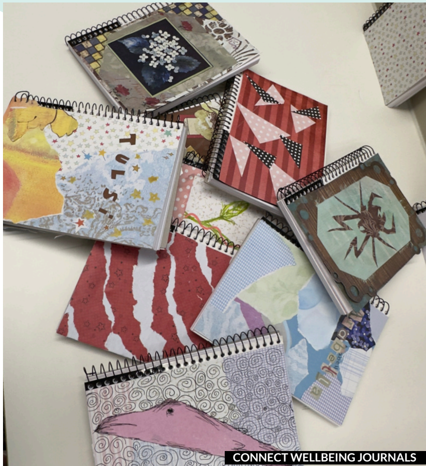
CONNECT WELLBEING JOURNALS