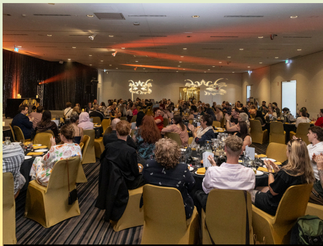
SASY 2024 GRADUATION AND SENIOR SCHOOL DINNER