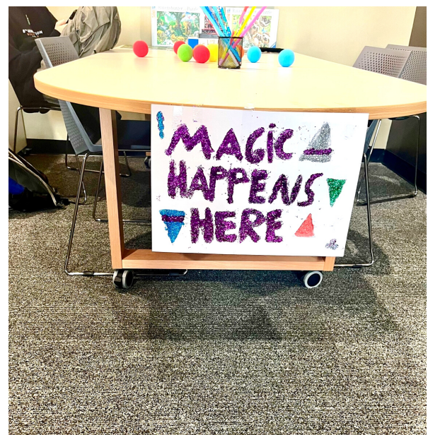
TOP: PROMO DESIGN FOR SHOWCASE BOTTOM: INSPIRE HUB DECOR

SASY's bi-annual Showcase exhibition was held in Week 10 of Term 2, with the theme 'Mosaics.' It was a vibrant celebration of the growth and accomplishments of young individuals involved in various programs. The event highlighted the diverse talents and achievements of our young people, showcasing their individual contributions that come together to form a beautiful mosaic. Through this event, the SASY community were given the chance to acknowledge and celebrate the unique journeys and successes of these young people, creating a platform for them to shine and inspire others. It was amazing to see all of our young people's work on display! More photos here.