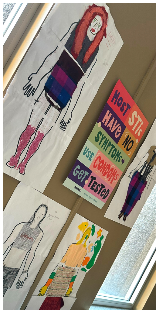
L: YOUNG PEOPLE ON AN EXCURSION TO THE ANDY WARHOL EXHIBIT R: HUMANS BEING HUMANS PROGRAM

Fantastic artwork has been created during Individual Learning, mainly using lead pencils to create a wide range of art styles on paper. Various mandala and other mindful pictures helped a large cohort of students to be present in the moment and alongside walking excursions, were heavily favoured activities in the Hub.