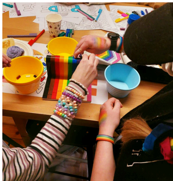
PRIDE DAY CRAFTS IN EMPOWER HUB

All young people are welcome and safe here at SASY, today and always. If you want to learn more about Pride Month and the LGBTQIA+ community, visit Minus18 .