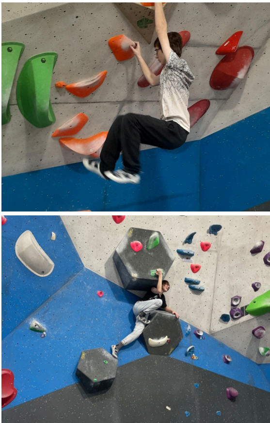
TOP & BOTTOM: BOULDERING EXCURSIONS TERM 2 WORDS BY BRETT, SENIOR YOUTH WORKER

Our bouldering initiative continues to inspire and empower students, demonstrating that with dedication and support, they can conquer both physical and social obstacles.