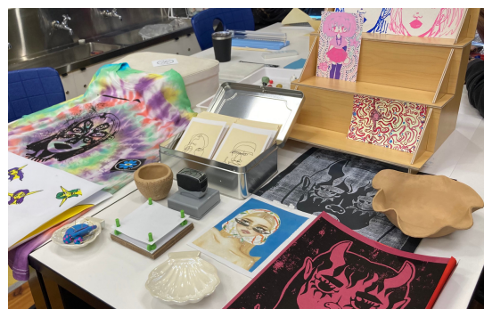
SOME OF THE PRODUCTS AVAILABLE AT SURREAL HARMONY