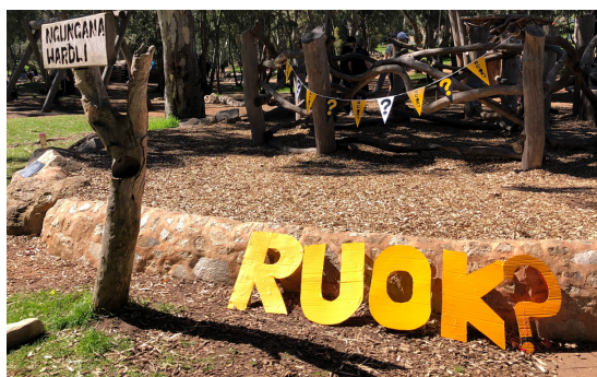
STUDENT ARTWORK AT MORIALTA RESERVE

Make sure you check in with your friends and family and ask are you ok? A conversation could save a life.