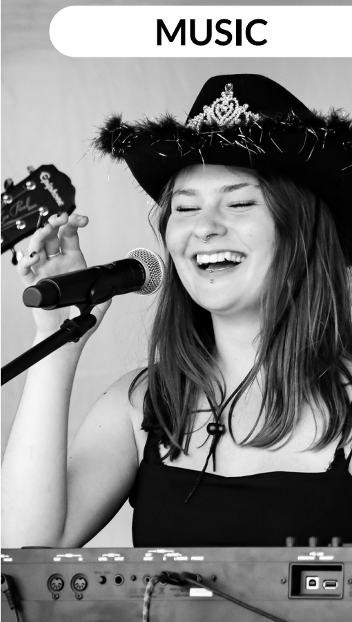
L & R: PERFORMANCE AT ROYAL ADELAIDE SHOW SEPT 2023

Ladies and gentlemen, let me take you on a musical journey with the extraordinary school band that has been making waves in our community.