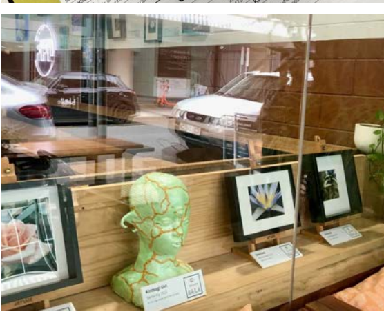
WORDS BY JO TEACHER IN IGNITE