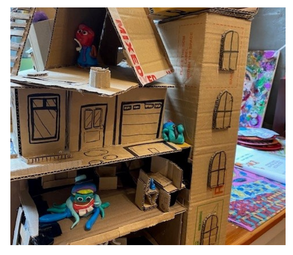
MIDNIGHT RAMEN & ADVENTURE PROGRAM

The Showcase in Semester 2 was a major success, with many students submitting their art and putting it on display. It was fantastic to see so many young people and parents/carers come along to see our spaces and our exhibit. There has been massive uptake in the Adventure Program this year, with key trips such as stand up paddleboarding, snorkelling, raft building, surfing, crate stacking at Mylor and kayaking to name a few! The Tokyo Drift STEM program was introduced, where students and staff built and raced remote control cars as well as CO2 Dragsters, where students designed and made drag cars. Midnight Ramen was launched, a creative art based program focussing on team work and collaboration and Humans Being Humans, an interactive program looking at the human body, relationships and behaviours. This particular program had high levels of student attendance and input and was an enriching experience for staff and students alike. We can't wait to see what 2023 has in store for Connect and wish you all the best over the break!