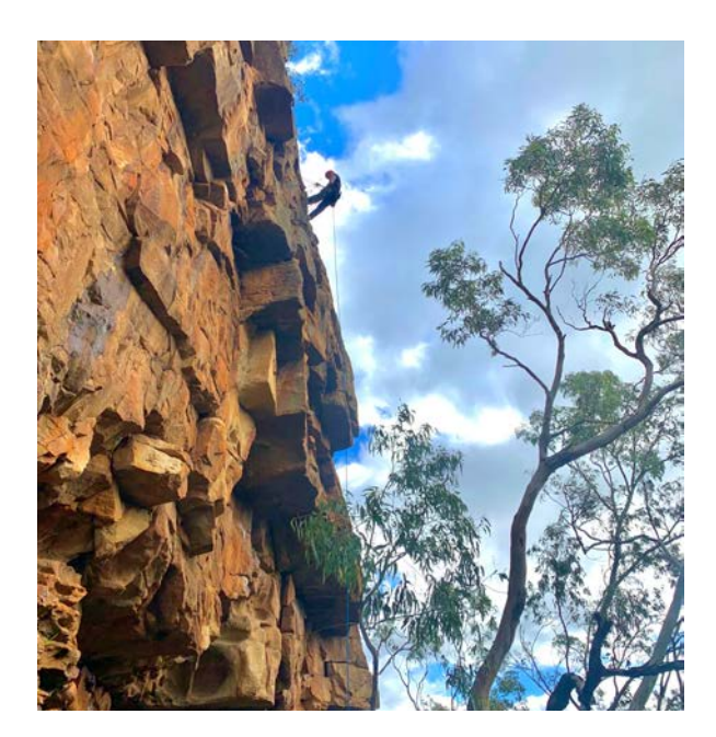
ADVENTURE PROGRAM WITH OPERATION FLINDERS