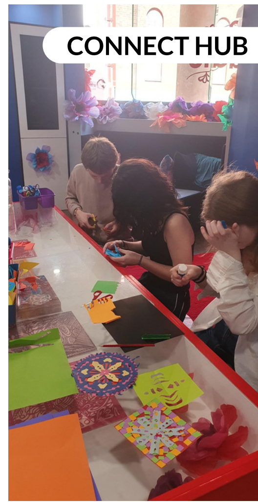
R: ART THROUGH THE AGES PROGRAM