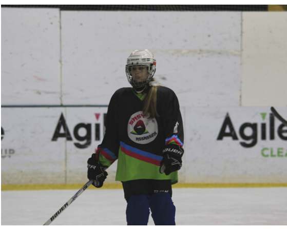
WORDS BY GRACE