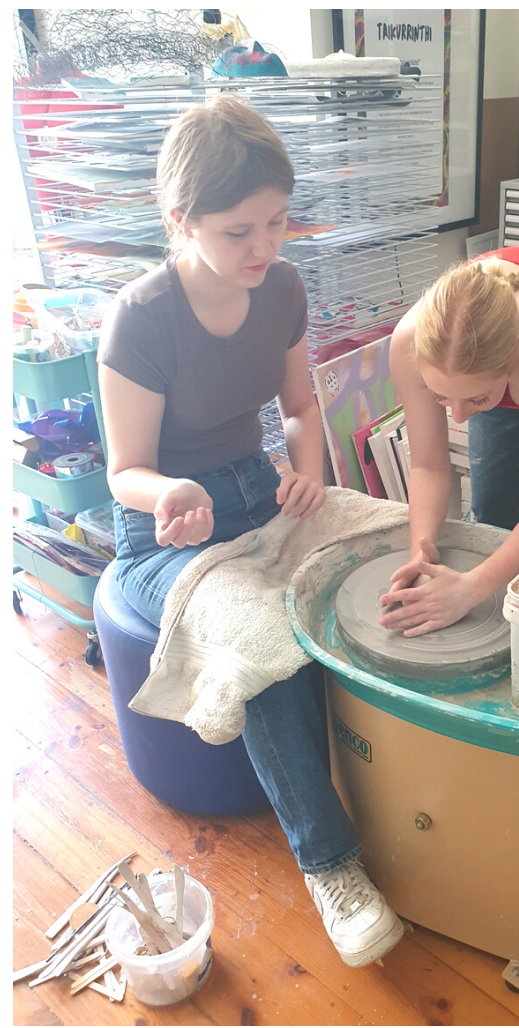
L: LAWN BOWLS IN ALT SPORTS R: SCULPTURE DURING FREE-TIME